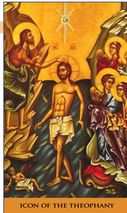
ICON OF THE THEOPHANY

We Christians all share a common vocation in Christ through Baptism. This common vocation is the call to mission - to Christ’s own mission of furthering the Kingdom of God here and now. The setting in which each lives this vocation and the manner of service vary. Some may understand early in life a call to a particular lifestyle and fulfill this call. Some may need to walk in a spirit of searching discernment for a longer period of their lives. For a Christian, prayer to know and live a particular lifestyle that glorifies God is important. For some, one path will be lifelong, but for many, changes will occur – and perhaps more than once.